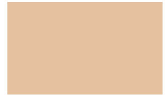
*Tan (SRI = 82)