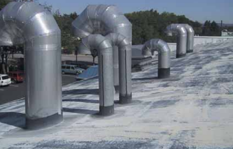
Before: Overview of existing 39-year-old Carlisle roofing system.