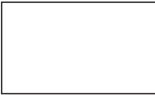
**Bright White (SRI = 100-110)